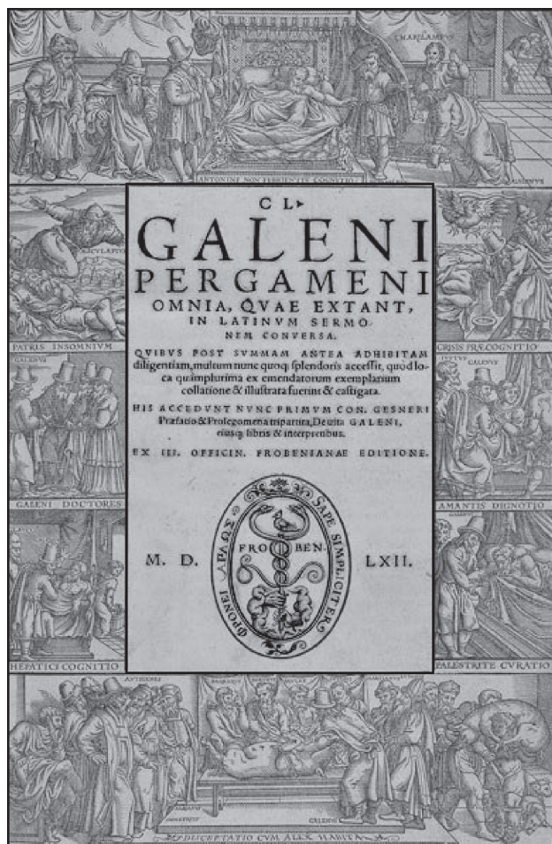
Figure 2. Complete works of Galenus, 1562 edition, Offizin Frobenius, Basel.

If gross brain pathology was inconsistent with the concept of idiopathic epilepsy, what then was the (functional or morphological) pathology underlying it? This question was much discussed in the period around 1900, and its clarification appeared at the time to be the major research objective for the 20th century (Wolf, 2009). Hereditary predisposition, however, was considered the primary cause (Turner, 1907; Binswanger, 1913), and this has meantime been underpinned by increasingly more detailed genetic research.