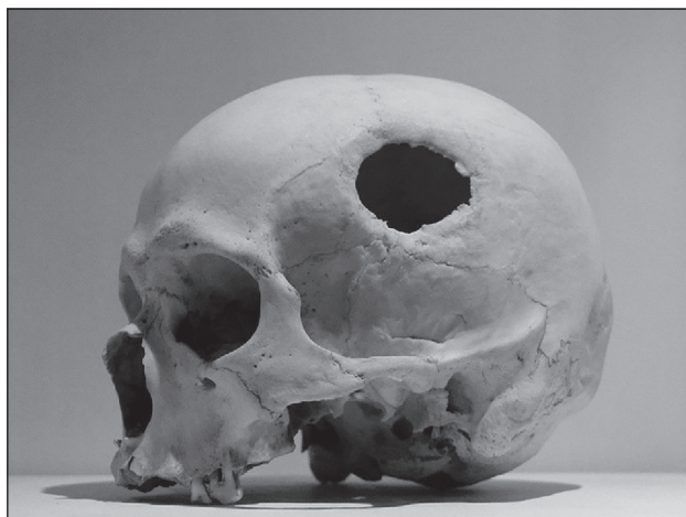
Figure 1. Trephined skull. No signs of trauma, and bone apposition confirms that the patient survived for a considerable time. Inca, Precolumbian period.

This is witness to a rational, scientific approach to epilepsy very early in the history of mankind, which was in striking contrast to popular beliefs considering epilepsy as a disorder sent by gods or other supernatural forces. A Babylonian cuneiform tablet from 1067-1046 BC reveals the knowledge of different kinds of seizures and ascribes them to the influence of various demons or evil spirits (Kinnier Wilson and Reynolds, 1990). It is, however, uncertain whether natural or supernatural explanations were distinguished at the time. How different was the concept of an invisible force producing seizures in somebody from an experience of a lightning bolt coming out of the sky